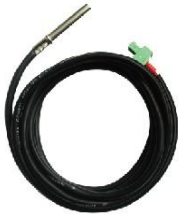
RTS300R47K3.81A Remote temperature sensor (3m)